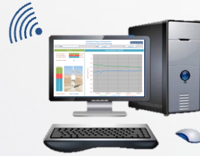
Visualisation in office